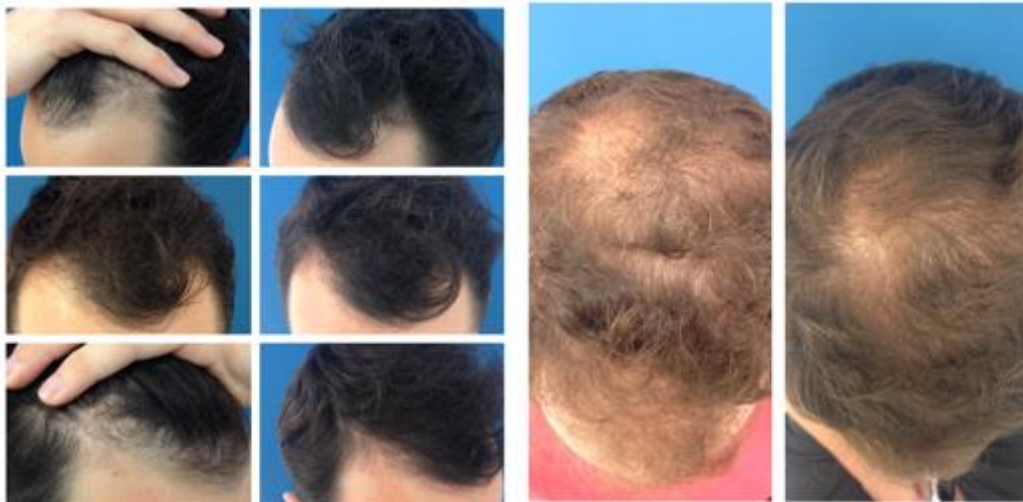
Figure 2: pre and post pictures. Left: case 1 (Day 0 top - Day 30 bottom). Right: case 2 (Day 0 left - Day 30 – right).

The analysis of the photographic evaluation (fig. 2) showed an improvement of hair density in four patients, that is 23.53%. Thirteen patients (76.47%) didn't notice any change, and none of them noticed worsening of hair density.